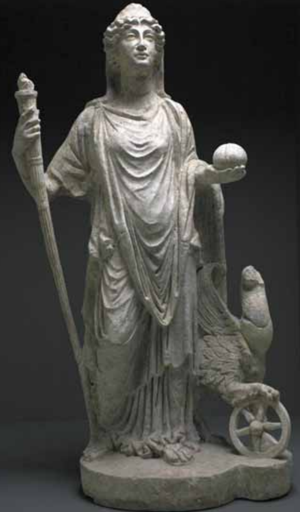
On the cover: a statue of Fortuna Nemesis from the governor's palace

Permanent exhibition at the Aquincum Museum