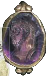
Gold ring with a portrait of the Emperor Caracalla