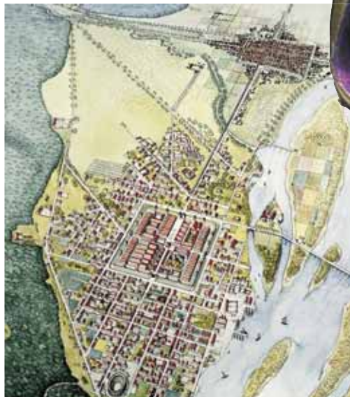
A bird's eye view of Aquincum (theoretical reconstruction by M. Schaub)