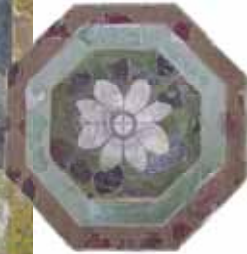
Detail from a reconstructed ceiling fresco

SCENES FROM THE OFFICIAL RELIGION were played out in the two shrines brought to light in the palace. Based on altar stones discovered in the southern wing of the main building, the governors raised altars to the deities of the Capitoline triad. The podium temple in the courtyard contained a monumental statue of the emperor in it as part of the emperor cult, which was proclaimed an established religion. The fact that several emperors from Domitian to Valentinian I also visited Aquincum demonstrates Aquincum's significance. Septimus Severus certainly visited the palace with his retinue. In AD 202, he celebrated the tenth anniversary of his rule with visits to major settlements in Pannonia.