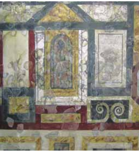
A fresco, depicting the interior of a building, ornamented one wall of a representative room in the governor's palace

THE AURA OF WEALTH in the palace was increased by the frescos painted on its walls. The patterns that were used followed the imperial fashions of the day. The first masters to work there probably came from Italy, while later it was usually local painters from Aquincum who were charged with decorating the palace.