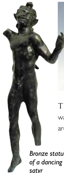
Bronze statuette of a dancing satyr