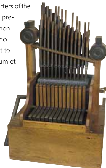
The first sound producing model was manufactured a few years after its discovery by the organ-making firm of Angster in Pécs in 1935