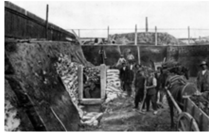
The archeological excavations on the find-location of the organ