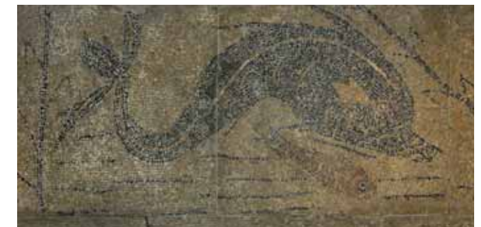
Detail of a mosaic depicting a sea scape from the central hall of the palace bath wing

THE GOVERNOR'S PALACE had a captivating exterior appearance and a luxurious interior design. In addition to simple bevelled brick and terrazzo pavements, certain rooms, in fact even the toilet, were paved with mosaics.