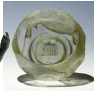
Inscribed glass beaker from the governor's palace

THE GOVERNOR'S PALACE in Aquincum was an outstanding example of Pannonian decorative architecture. Nevertheless, only a few marble fragments, bronze statues and glass vessels were recovered during archaeological excavations. These few pieces attest to the magnificent interior design of the building and the private luxury enjoyed by its inhabitants.