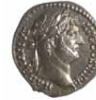
A depiction of Emperor Hadrian on a silver coin

BECOMING THE SEAT of Pannonia Inferior gave significant impetus to Aquincum's development (AD 106). Hadrian, a later emperor, was the most famous governor of Pannonia Inferior (AD 106–108). Within its characteristic triple settlement structure, the northeastern part of the Military Town enclosing the legionary fortress served administrative purposes. The pomp and circumstance of the governor's palace was meant to stand out since it represented the power of Rome in the center of the province.