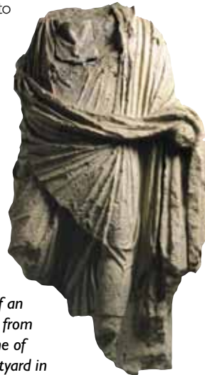
Statue of an emperor from the shrine of the courtyard in the governor's palace

SCENES FROM THE OFFICIAL RELIGION were played out in the two shrines brought to light in the palace. Based on altar stones discovered in the southern wing of the main building, the governors raised altars to the deities of the Capitoline triad. The podium temple in the courtyard contained a monumental statue of the emperor in it as part of the emperor cult, which was proclaimed an established religion. The fact that several emperors from Domitian to Valentinian I also visited Aquincum demonstrates Aquincum's significance. Septimus Severus certainly visited the palace with his retinue. In AD 202, he celebrated the tenth anniversary of his rule with visits to major settlements in Pannonia.