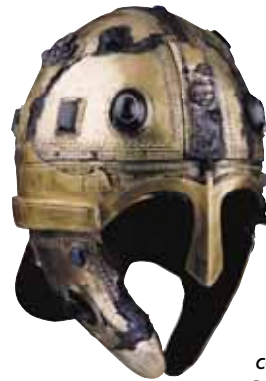
A parade helmet, its owner must have been a high-ranking military commander in the Late Roman army

From this time on, only the military direction of the freshly established Valeria province remained in Aquincum. The palace of the dux, the military leader, was transferred from the Danube island to the area of the former legionary fortress. ■