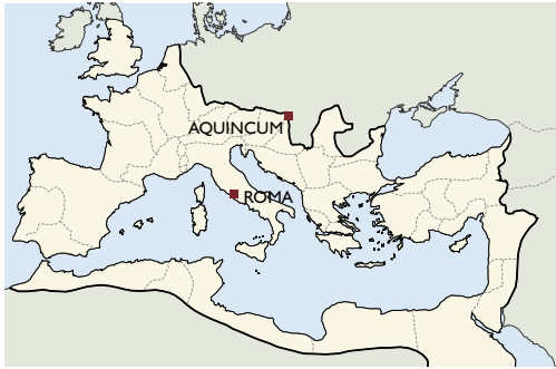
The territory and provinces of the Roman Empire at its largest extent in the AD 2nd century

AQUINCUM, located within the territory of modern Budapest (Óbuda) became part of the Roman Empire and Pannonia province in the AD 1st century. Emperor Trajan divided Pannonia, until then a single unit, into two parts in AD 106. Aquincum was designated the capital of Pannonia Inferior, the eastern part of the province. The military and administrative significance of the settlement and its central role in the economic and commercial life of the province also influenced the development of the town. ■