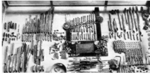
The first display of the organ in the 1930s. Nearly 400 elements from the organ were recovered during the excavation